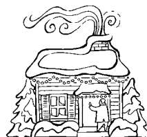
Remember our Shut-ins